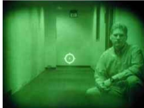
Red or Green up head display variant Seen through a night vision scope mounted 2" behind the optics